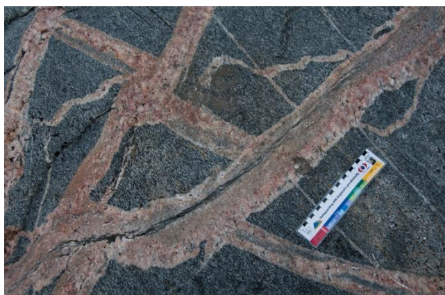
Figure 2 Photograph of cross-cutting veins at locality1, Ataa, West Greenland.

Figures 2, 3 and 4 are photographs taken in Ataa, West Greenland and show veins cutting the Archean migmatitic gneisses described by Escher et al. (1999). For this exercise give your students a copy of one of these three photographs and ask them to look at the cross-cutting relationships shown in the photograph and draw a labelled sketch that shows the order in which the veins formed.